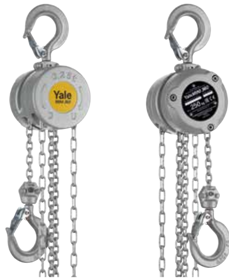
Capacity 250 kg